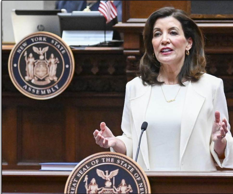
Governor Hochul delivering the 2022 State of the State address.

ConnectALL is Governor Hochul's initiative to transform New York's digital infrastructure, build a robust broadband marketplace, and bring affordable, reliable, high-speed internet service to all New Yorkers.